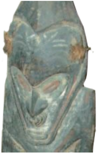
detail pic 4

Walden, Herwarth: zur kunst der neger und südseeinsulaner. In: Der Sturm «Sonderheft Afrika Südsee», Berlin1926, pp.72-76