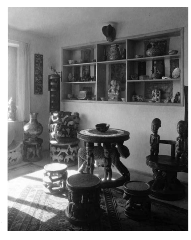
pic. 1: Living room of the collector Nell Walden in Ascona, Switzerland, approx. 1935. 2.

«(...) the Swede Nell Walden, painter, writer and poet, was an important collector. Her passion for collecting also included ethnological art and she was a crucial figure in the recognition that this ethnological art influenced modern European art. Her collection, which is so significant for the history of art in the 20th century (...)»<sup>1</sup>