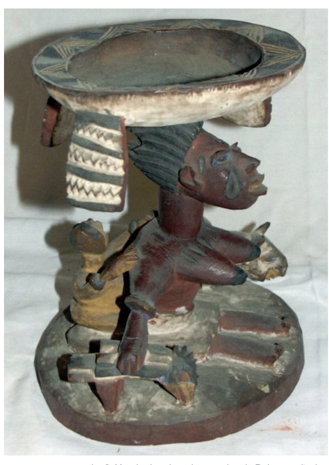
pic. 6: Yoruba bowl carrier, previously Dahomey (today Benin), approx. 1885 (BU-W125-4a)