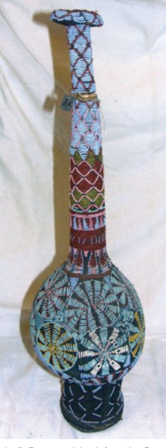
Sepik, Papua New Guinea, eroonian Grasslands, decorated with pearls, approx. 1910 (BU-W110)